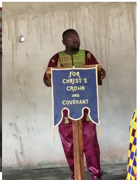
Brikama RP Church