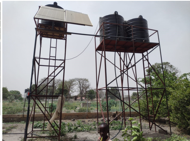
Village Development Borehole