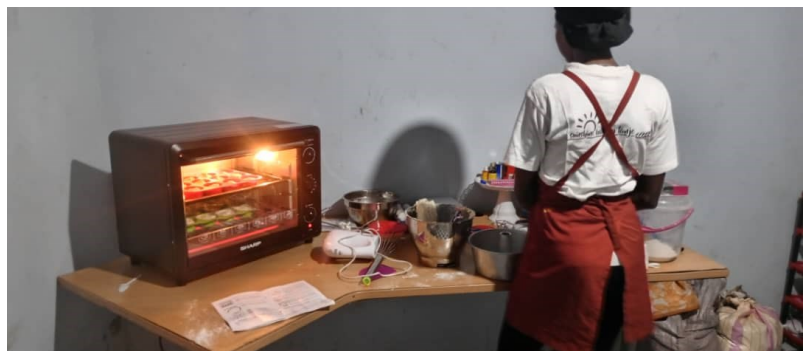
Bakery—Small Business Startup