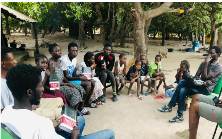
Kabekel Bible Study

Each week, Brikama RP Church hold Bible studies in both Brikama and Kabekel, a nearby village. Many who are attending have requested and been provided with Bibles. Please remember these weekly Bible studies, as the church reaches out with the Gospel. They have been looking at the deity of Christ and the fatherhood of God. They have been particularly encouraged by interest in the Bible studies from an increasing number of younger people.