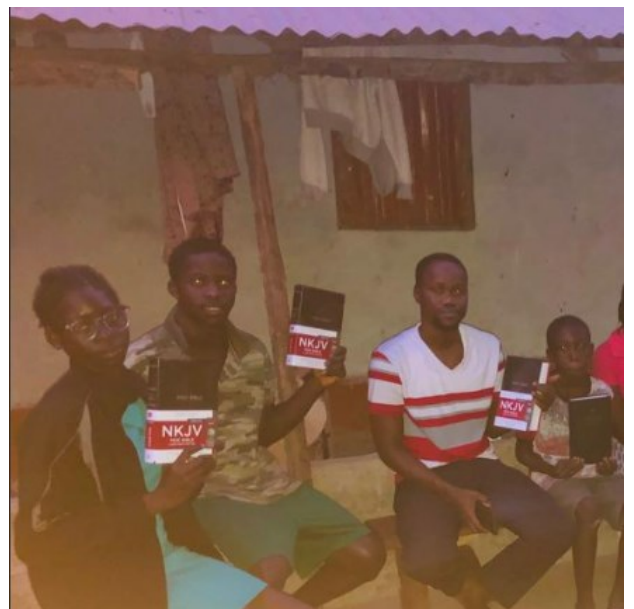
Brikama Bible Study